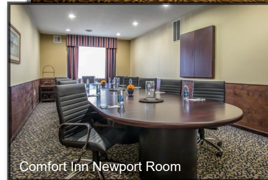
Comfort Inn Newport Room