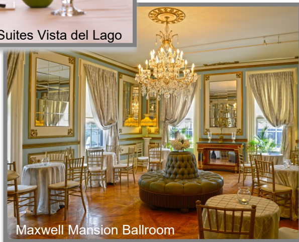
Maxwell Mansion Ballroom