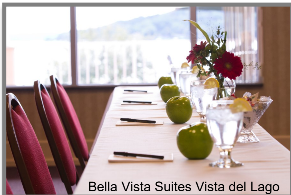
Bella Vista Suites Vista del Lago