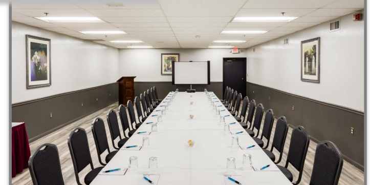
Harbor Shores Pelican Bay